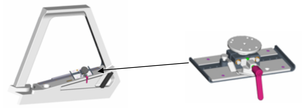
FIGURE 2: Captain's Side Window Modified With EZMount Slider (First Officer's Installation is Mirror Image)