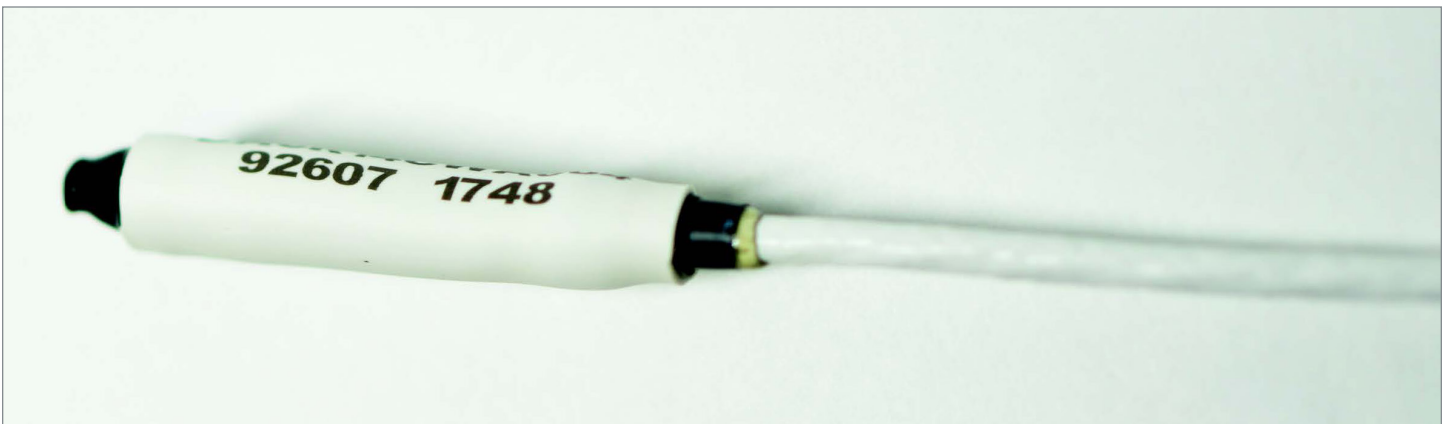
120 Ω Lightweight CANbus Terminator

The extruded outer jacket strips easily, simplifying termination while the small diameters and short cap lengths simplify harness routing through tight spaces on the aircraft.