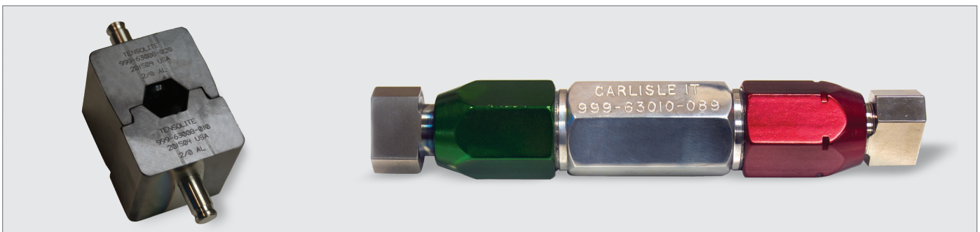
Crimp gauge and die