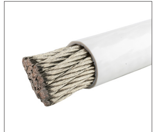
HVR-260-1/0N 92607 High-Voltage Extruded Wire

Part of our high-voltage series, our high-voltage extruded wires are capable of 1,000-volt performance while maintaining excellent flammability and arc-propagation resistance. They are ideal for applications, such as aerospace, that require a cable with excellent safety factors as well as user-friendly features like: