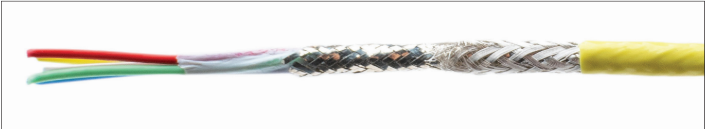
NF24Q100-01-DL-ALW Lightweight 100 Base-T Ethernet Quad Cable

Since the aerospace market is always looking to reduce weight on aircrafts, Carlisle Interconnect Technologies (CarlisleIT) NPD Engineering has developed a new 100 \Omega quad Ethernet cable to minimize weight. By using an aluminum round shield in place of the standard tin shield, the new cable design allows for a substantial weight savings, without sacrificing temperature rating or electrical performance.