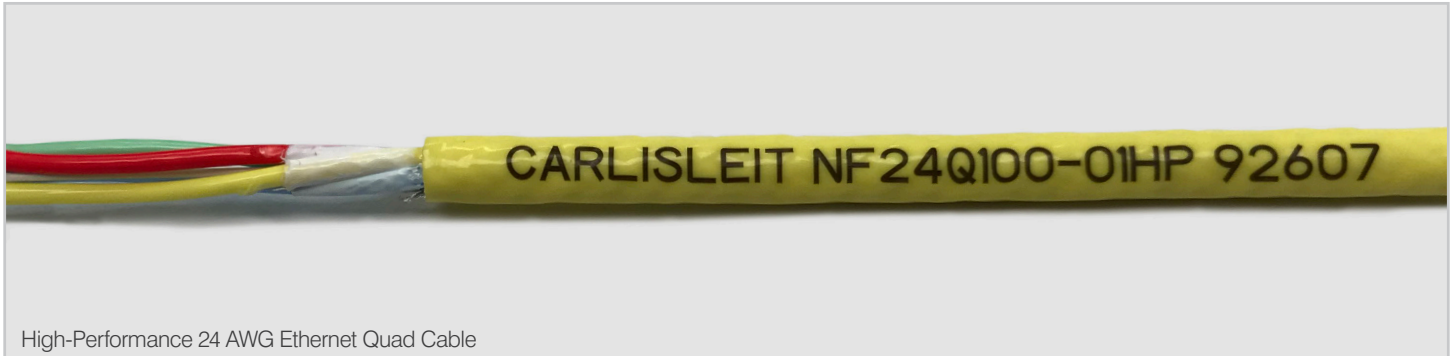
High-Performance 24 AWG Ethernet Quad Cable

Carlisle Interconnect Technologies (CarlisleIT) is excited to announce the newest addition to our NETflight® Ethernet Series: NF24Q100-01HP, a high-performance 24 AWG Ethernet Quad Cable designed to provide reliable performance at extreme data rates in a 100 \Omega quad construction. Part of our robust family of data cable products, this cable is: