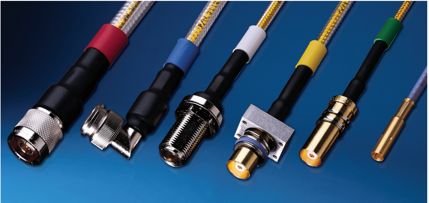
Left to Right: 310801 to N Plug; 311201 to TNC 90 Plug; 311501 to N Bulkhead Jack; 311601 to Size 1; 352001 to Modified Size 1; 3C058A to Size 5