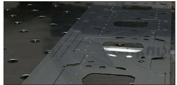
Cut parts ready for deburring