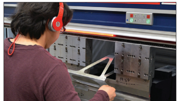
Forming using a custom window die