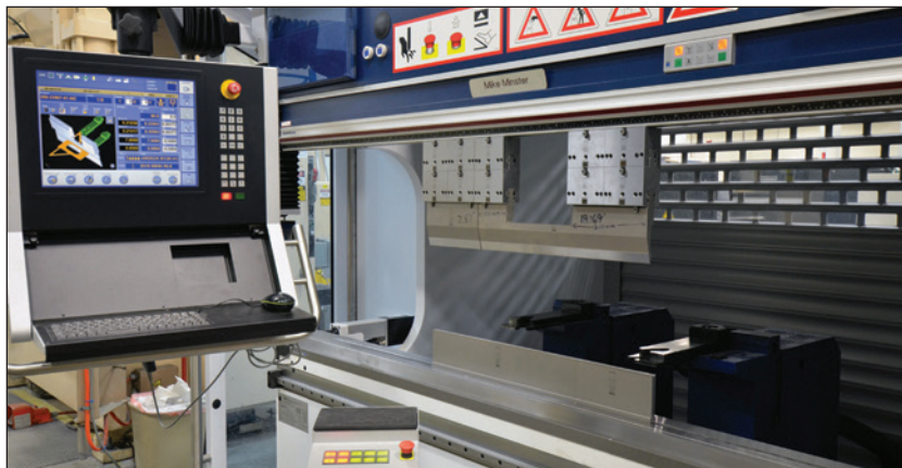
Multi-axis stops and 3D model interface allows precision forming with minimal set-up