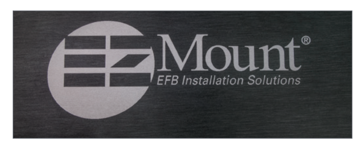
Laser-marked EZMount logo on black anodized aluminum