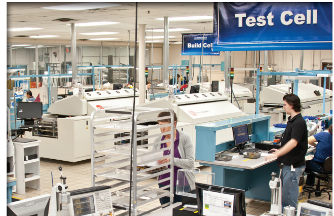
Burn-in, thermal shock and thermal cycle testing available in-house