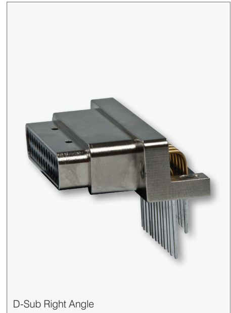
D-Sub Right Angle