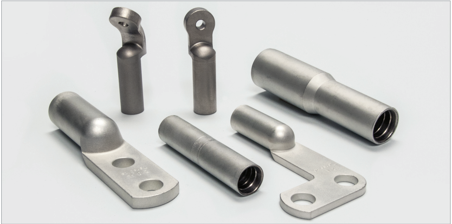
Custom Capabilities Examples Shown from Left to Right: 2-Hole Narrow Tongue Terminal Lug; Bent Tongue; Splice; 1-Hole Tongue; Flag-Style Terminal Lug; Transition Splice