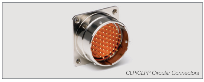
Our CLP/CLPP Circular Connectors are ideal for blind-mating in IFE (In-Flight Entertainment) systems and aircraft galley applications where intermateability with MIL-C-26500 is preferred. These connectors will readily mate with MIL-C-26500 bayonet-type plug MS24266R series connectors and can be PC board-mounted.