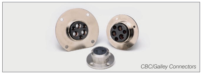
Our CBC/Galley Connectors are used by the airframe OMS, galley, and galley insert module suppliers. They have been standardized for ease of maintenance and interchangeability, and are designed to accommodate the many different plug-in warming devices and other ancillary units presently in use world-wide.