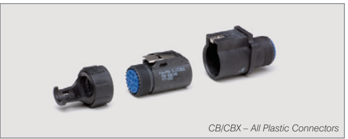
These lightweight-style connectors have a positive latch-type lock. CB/CBX Connectors are perfect for PC board and blind-mating applications.