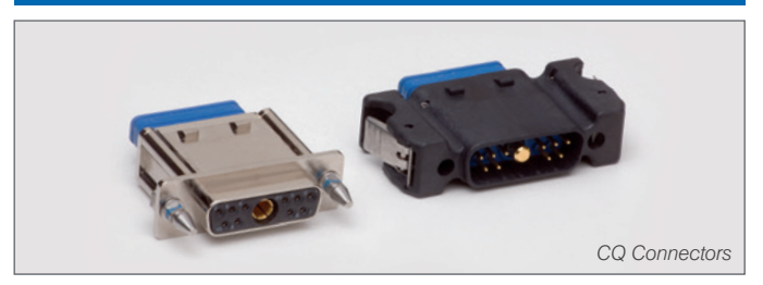
The CQ Connector's unique design emits an audible click when mated. It is ideal for blind-mating applications and hard-to-reach places, such as under passenger seats. It mates with any standard D-Subminiature or MIL-C-24308 connector, when lockpost hardware is installed.