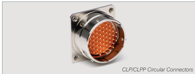
CLP/CLPP Circular Connectors

Our CBC/Galley Connectors are used by the airframe OMS, galley, and galley insert module suppliers. They have been standardized for ease of maintenance and interchangeability, and are designed to accommodate the many different plug-in warming devices and other ancillary units presently in use world-wide.