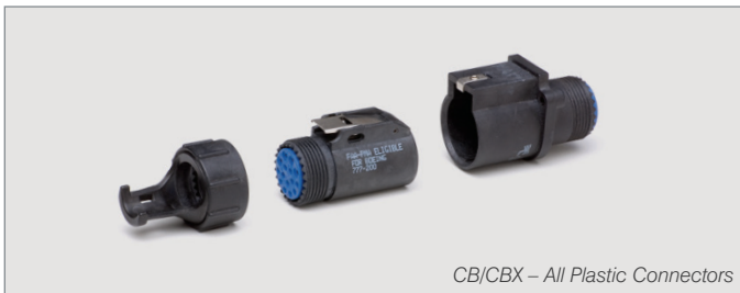
CB/CBX – All Plastic Connectors

The CQ Connector's unique design emits an audible click when mated. It is ideal for blind-mating applications and hard-to-reach places, such as under passenger seats. It mates with any standard D-Subminiature or MIL-C-24308 connector, when lockpost hardware is installed.