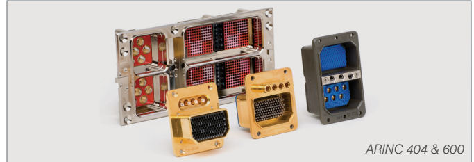
ARINC 404 & 600

Our ARINC Connector capabilities range from standard to complex with custom inserts, filtering, and harnessing options available – we do it all. Please contact our Kent, WA facility at 1 (800) 227-5953 for more information.