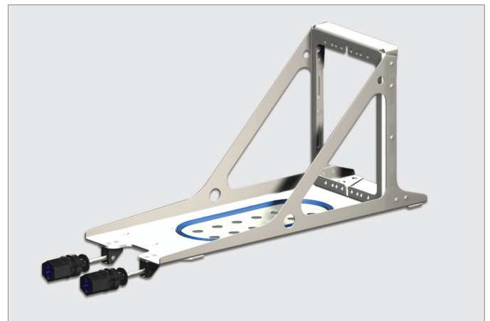
Lightweight Tray with Insertion-Extraction Hold-Downs