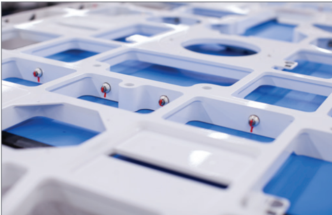
FlightGear™ ARINC 791 Ka, Ku, Ka/Ku Universal Installation

Amphenol-CIT, in partnership with Saint Gobain Performance Plastics, offers multiple ARINC 791 solutions for Ka-band, Ku-band and Ka/Ku SATCOM installations. Our ARINC 791 adapter plate solution fulfills the need for standardized installation, easier maintenance inspections, and overall lower cost of ownership. Installation packages are available for a wide range of aircraft. Details of available certifications, in process engineering, and customizations are always expanding and can be furnished upon request.