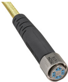
Octax®-Solo Adapter Cable Assembly