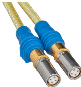
Octax®-Solo Adapter Cable Quadrax Contact