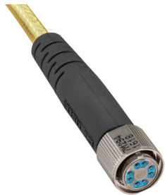
Octax®-Solo Adapter Cable Assembly