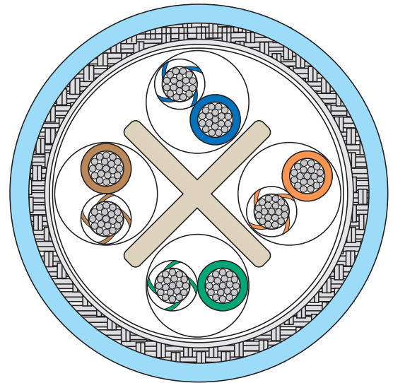
MX10G-24-ALW Cross Section