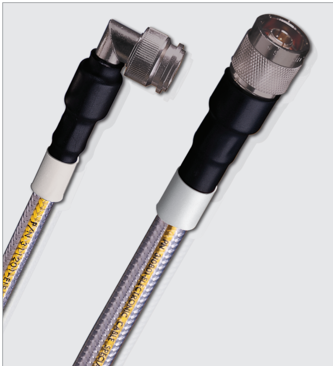
311201 and 310801 Low PIM Cable Assemblies