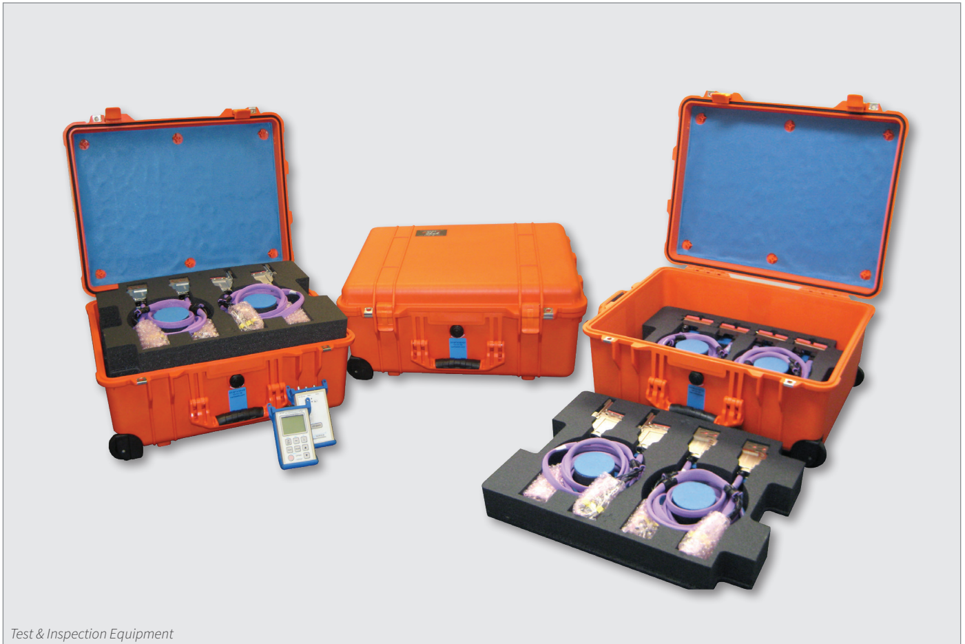
Test & Inspection Equipment